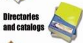
Directories and catalogs