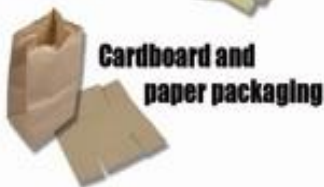
Cardboard and paper packaging

Cardboard & food Packaging: Flatten or cut boxes. Recycle cereal boxes and other clean food packaging including cake boxes, flour bags, frozen dinner boxes, paper egg cartons, paper grocery bags, shoe boxes, paper gift wrap, calendars, core tubes from paper and toilet rolls, soda/beer 12 pack carrying boxes, pizza boxes (if clean), etc.