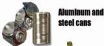
Aluminum and steel cans

Cans: Recycle aluminum cans and steel cans- including clean & dry paint cans, food and pet food cans, empty aerosol cans.