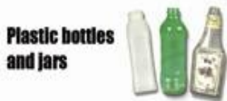
Plastic bottles and jars

Plastic Bottles and Jars: Recycle plastic bottles, jugs and jars