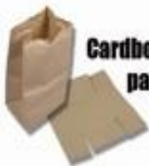
Cardboard and paper packaging

Cardboard & food Packaging: Flatten or cut boxes. Recycle cereal boxes and other clean food packaging including cake boxes, flour bags, frozen dinner boxes, paper egg cartons, paper grocery bags, shoe boxes, paper gift wrap, calendars, core tubes from paper and toilet rolls, soda/beer 12 pack carrying boxes, pizza boxes (if clean), etc.