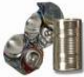
Aluminum and steel cans

Cans: Recycle aluminum cans and steel cans- including clean & dry paint cans, food and pet food cans, empty aerosol cans.