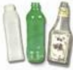
Plastic bottles and jars

Plastic Bottles and Jars: Recycle plastic bottles, jugs and jars